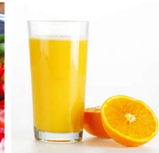
Freshly Squeezed Orange Juice

BREAKFAST Croissants & Pastries £4.75 Freshly Baked Croissants Smoked Salmon Bagels Fruit Danish/Muffins Fresh Fruit Skewers