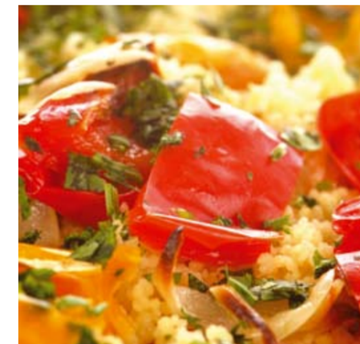
Mediterranean Roasted Vegetable Couscous Salad