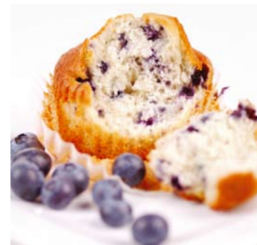
Homemade Blueberry Muffin