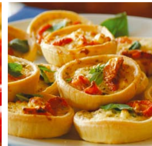
Feta Cheese, Sun Blushed Tomato and Basil Quiche